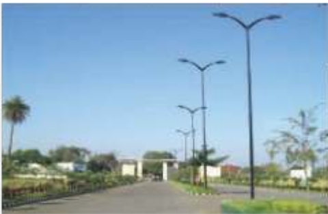
Treasure Town - Indore