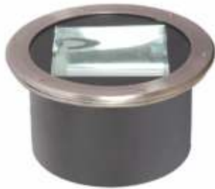
FGB 21 Series