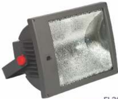
FI 300 Series