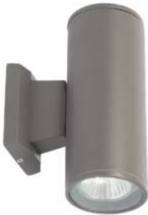
FC 2000 Series