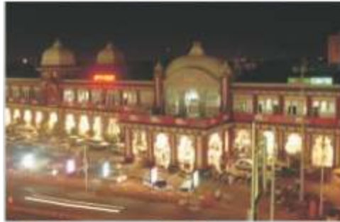
Egmore Railway Station - Chennai