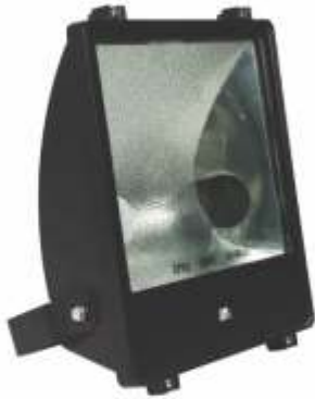
FI 400 Series