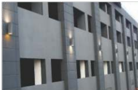
DGTP Mall - Pune