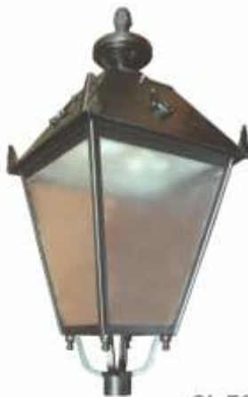
GL 500 Series