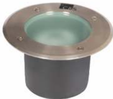
FGB 22 Series