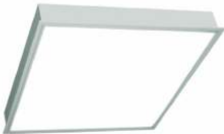
LT CRP 233 Range