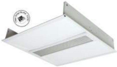
LT CRP Range