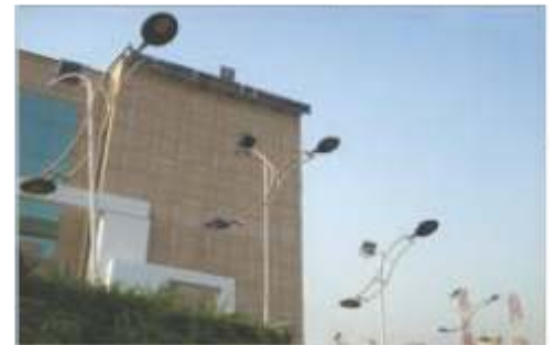
APIM - Delhi