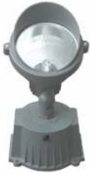
SP 1070 Series