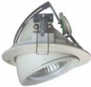
LT CR 1070/G12/ZM