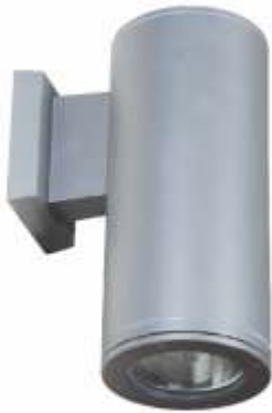
FC 1000 Series