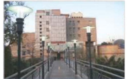
RML Hospital - Delhi