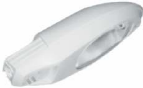
SS 200 Series