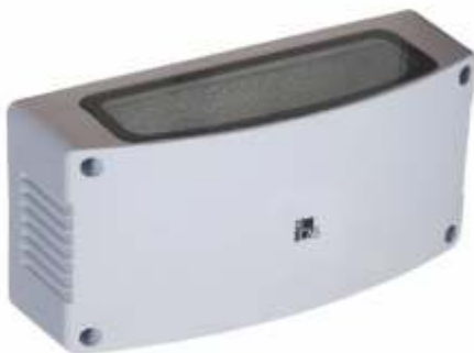
FC 2100 Series