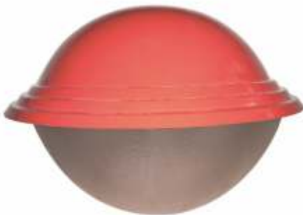
DSS 200 Series