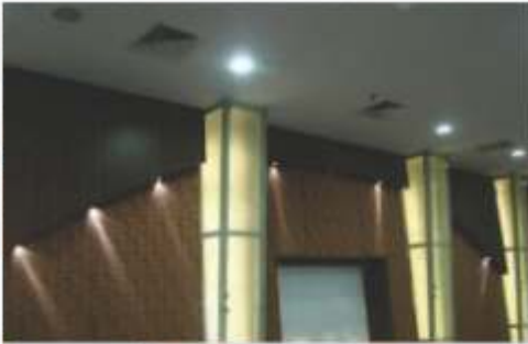
Motibagh Community Center - Delhi