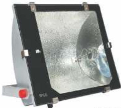
FN 1000 Series