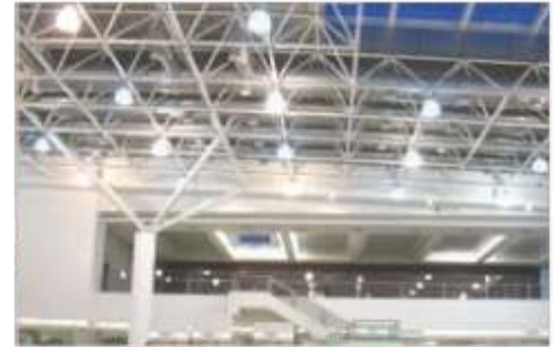
CST Airport - Mumbai