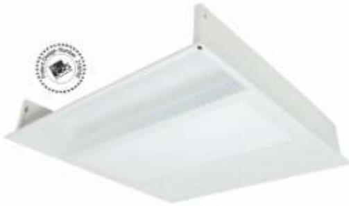
LT CRD Range