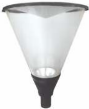
GL 30 Series