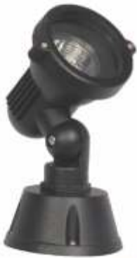
SP 1250 Series