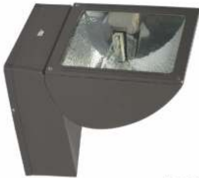
FC 2200 Series