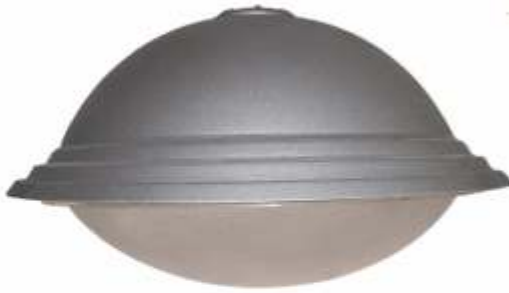
DSS 300 Series