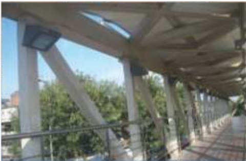
Pushpilhar FOB - Delhi