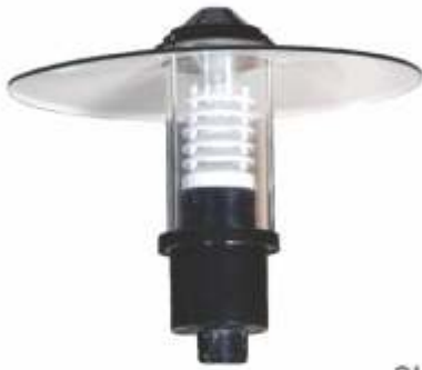
GL 33 Series