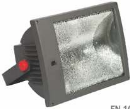
FN 100 Series