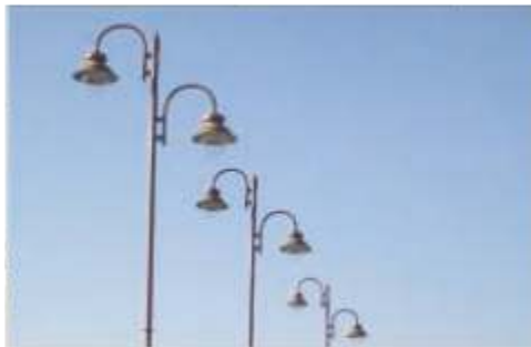
Singapur City - Indore