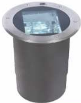
FGB 20 Series