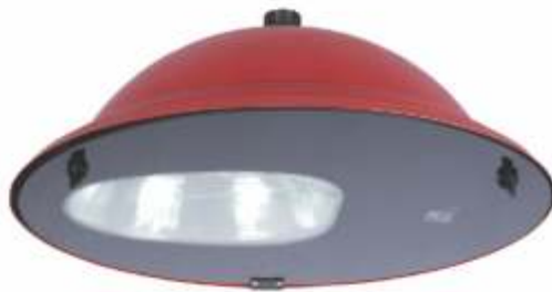
DSS 400 Series