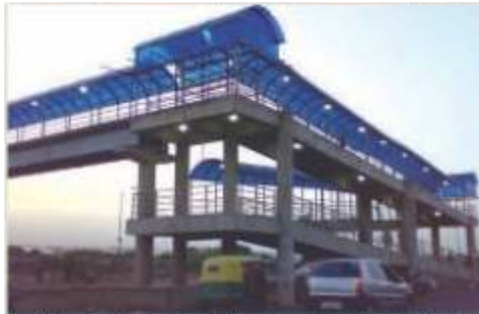
Shakarpur FOB - Delhi