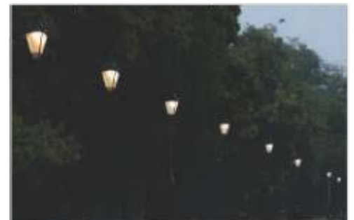
B.K.S Marg - Delhi