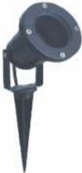
SPK 1050 Series