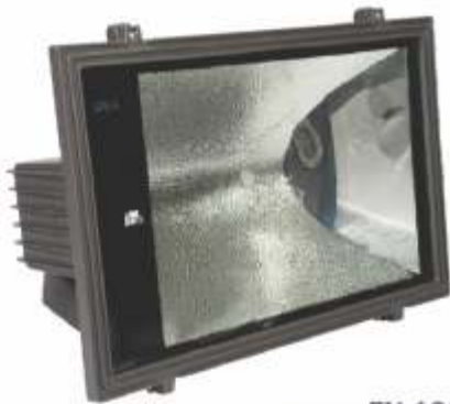
FN 1000 Series