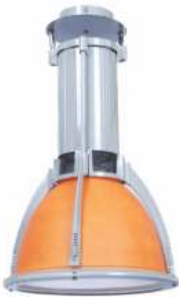
LT CP 221