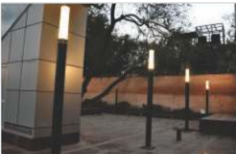
Sarojani Nagar - Delhi