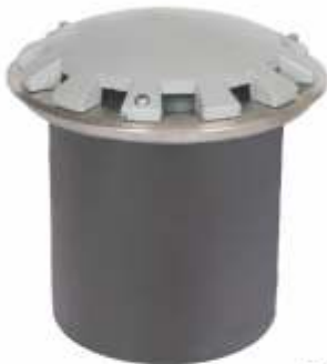
FGBM 20 Series