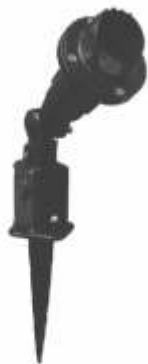
SPK 1250 Series