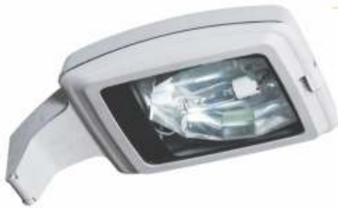
DSSQ 100 Series