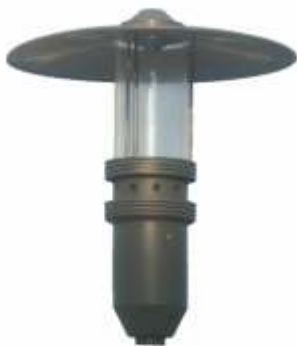
GL 32 Series