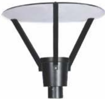
GL 31 Series